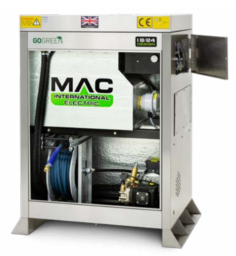
OPTIONAL INTERNAL HOSE REEL AVAILABLE